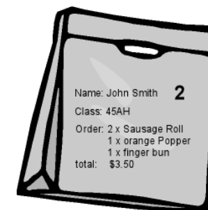
2 nd break example