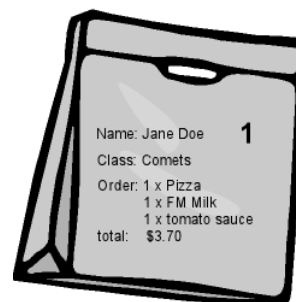
1 st break example